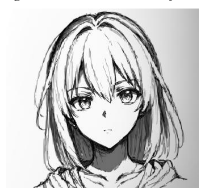
Figure 4: Author Generate Draft with AI