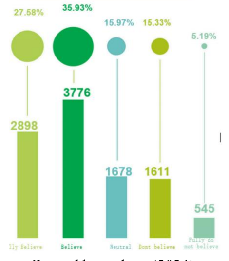
Figure 2: Consumer sustainable purchase data

Despite the availability of various methods to collect straw waste in China, there still exists a significant quality bias concerning the specific raw materials for the supply chain of straw-recycled products (Hu et al., 2022). The purchase of raw materials for straw recycling products in China is mainly from individual agricultural waste collectors in rural or urban areas. As a result, the straw recycling products of different brands may not have the same quality since the quality of raw materials differs when they are purchased from various individual merchants. Poor-quality straw is more likely to burn in high-temperature processing, leading to a secondary pollution issue in the processing line of straw raw products (Hu et al., 2022). In contrast, in the United States, the quality of agricultural straw is repeatedly screened by factory machinery after centralized collection to ensure that the quality of agricultural straw meets the requirements of the factory (Koul et al., 2022).