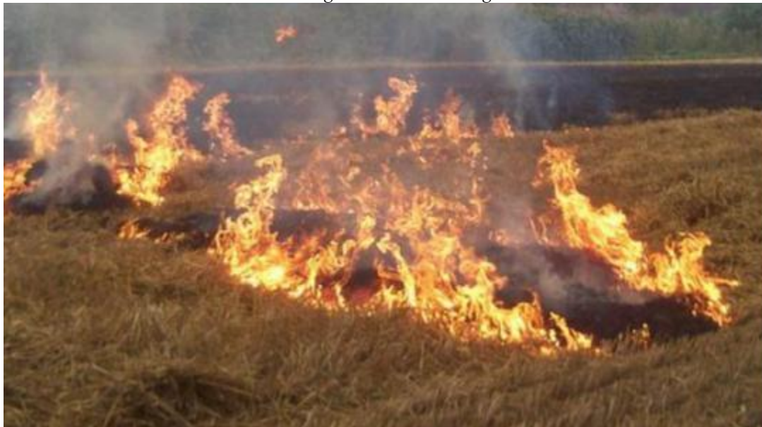
Figure 3: Straw burning

The regulation level of agricultural straw varies by region in China due to the vast land size. For example, the Environmental Protection Department in Jiangsu Province imposes fines for straw burning and even detention in severe cases. But the government departments lean more towards persuasion rather than enforcement in inland cities such as Hunan and others (Liu et al., 2021). The fragmented regulatory policies across different regions also breed resentment among farmers, hindering the overall reduction of agricultural pollution in China.