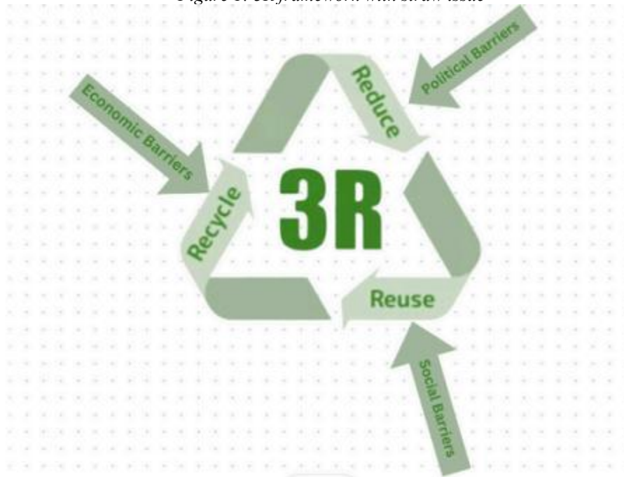
Figure 1: 3R framework with straw issue